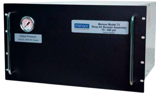
Model 73 - Pressure booster system