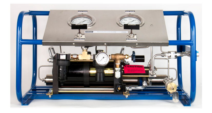
Figure 2 - Model 77