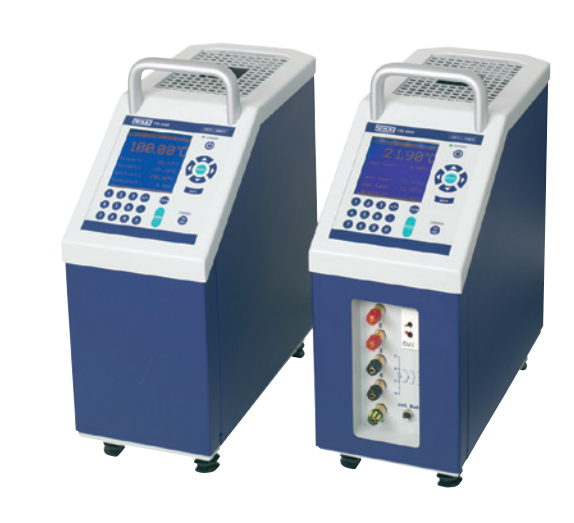
Fig. left: without integrated measuring instrument Fig. right: with integrated measuring instrument