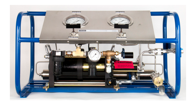
Figure 2 - Model 77