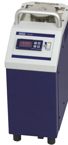
Micro calibration bath model CTB9100-225