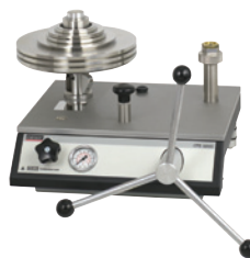
Pressure balance model CPB5000

Specifications according to data sheet 31.01