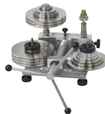
Pressure balance model CPB3000

Specifications according to data sheet CT 31.05