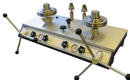
Differential pressure balance model CPB5000DP

Specifications according to data sheet CT 31.52