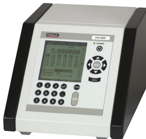
CalibratorUnit model CPU5000

Further specifications to CalibratorUnit CPU5000 see data sheet CT 35.01.