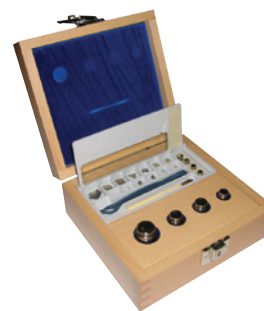
Set of trim-masses

1 x 50 g / 2 x 20 g / 1 x 10 g / 1 x 5 g / 2 x 2 g / 1 x 1 g / 1 x 500 mg / 2 x 200 mg / 1 x 100 mg / 1 x 50 mg / 2 x 20 mg / 1 x 10 mg / 1 x 5 mg / 2 x 2 mg / 1 x 1 mg