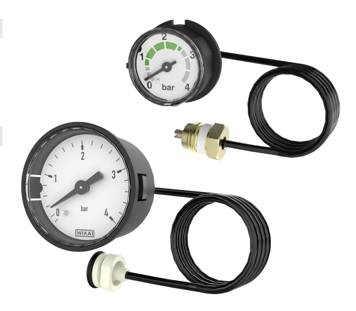
Fig. left: NS 40 [1 ½"] Fig. right: NS 27 [1"]