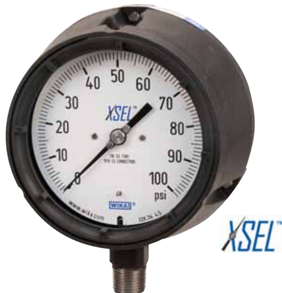
Bourdon Tube Pressure Gauge Model 222.34

Additional error when temperature changes from reference temperature of 68°F (20°C) ±0.4% of span for every 18°F (10°K) rising or falling.