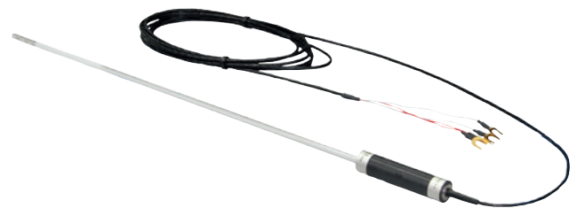
Standard platinum resistance thermometer, model CTP5000-T25

The resistance element is of pure platinum coiled and mounted in a strain-free construction. The former is of fused silica and great care is taken to ensure freedom from contamination. All the joints are welded, the four leads from